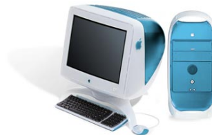
Power Macintosh G3 with Apple Studio Display