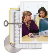
Apple Staff Development