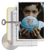
Apple Education Series